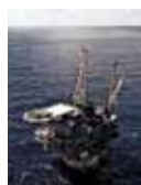
Perdido is the world's deepest offshore drilling and production facility.

The oil and gas industry is increasingly seeking new resources in offshore areas, often characterized by deepwater, remote and harsh environments. Specialized skills and technology are required to access these resources. Offshore's comprehensive portfolio of print and online products and global events are customized to help you make informed business decisions. At Offshore , reader benefit is the driving factor in making every editorial decision.